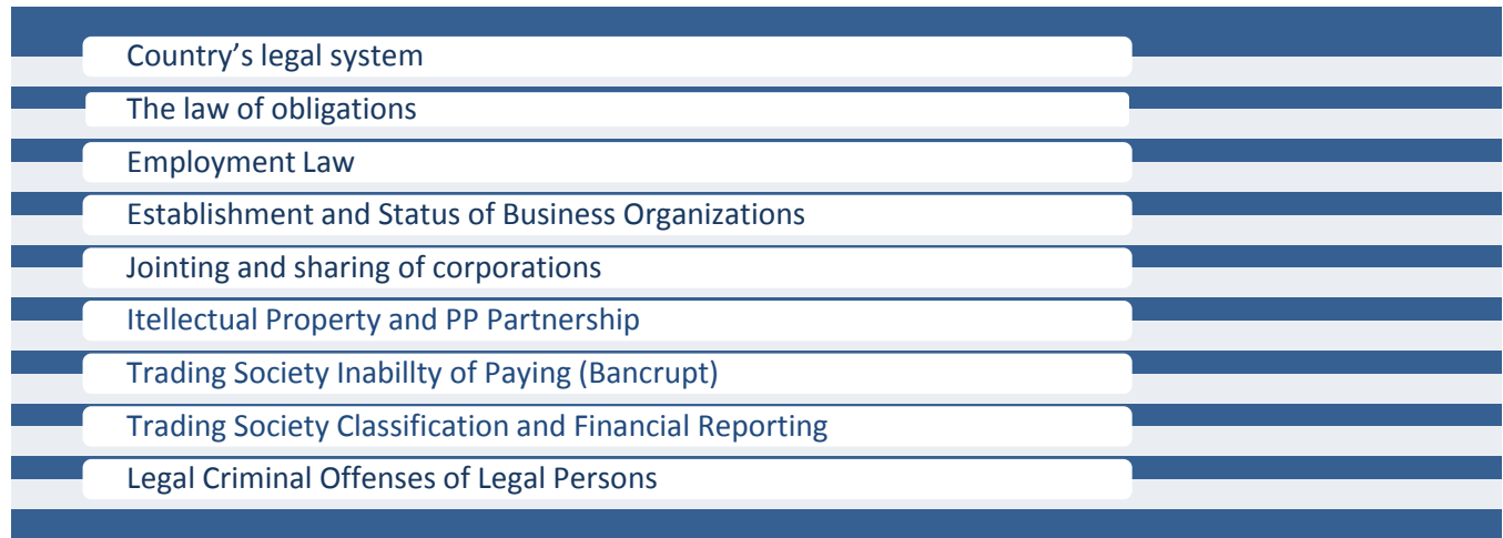
Diagram.2: Topics of Corporate and Business Law Module that will be covered during the training

Major topics of Corporate and Business Law Module that will be covered during the training: