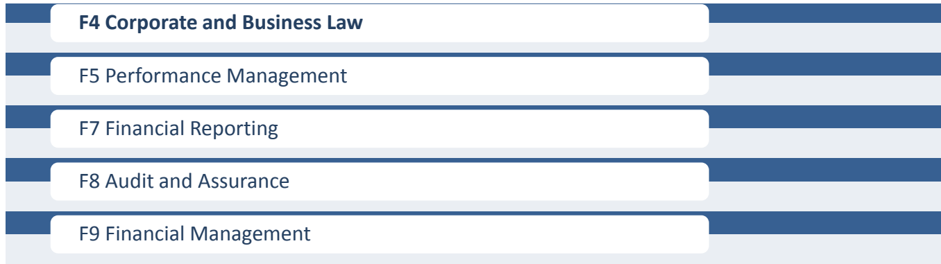
Diagram.2: CAP Certified Accountant Professional Qualification Level Modules

CAP Certified Accountant Professional Qualification Level consists of five modules and is mandatory to pass all five in order to obtain the title: