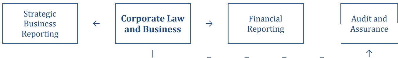
Diagram.1: Modules relations

The syllabus for Corporate and Business Law (LW) has direct and indirect links between other modules and preceding modules. Some modules are directly underpinned by other modules and other modules only have indirect relationship with each other such as links existing between the accounting and auditing modules.