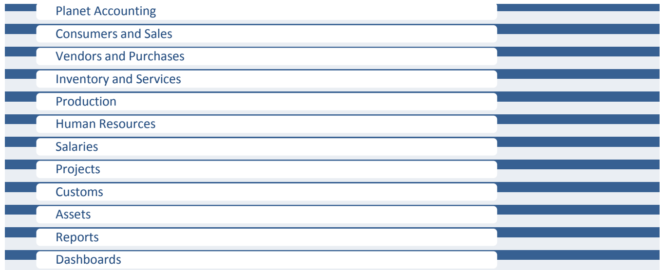
Diagram.1: Topics of Computerized Accounting Module which will be covered over the training

Major topics of Computerized Accounting Module which will be covered over the training: