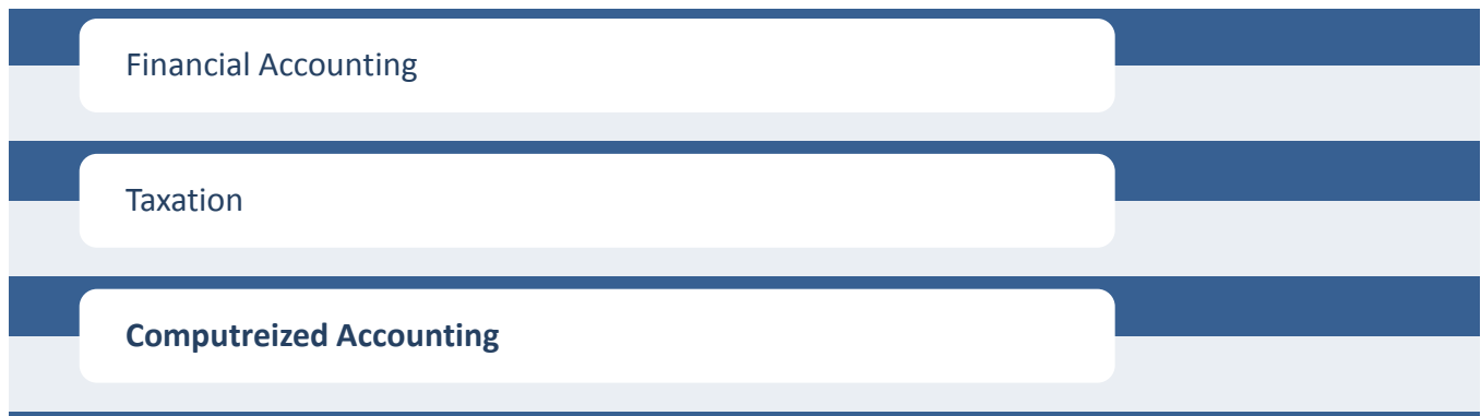
Diagram.2: Advanced Bookkeeping Qualification Level Modules

Advanced Bookkeeping Qualification Level consists of four modules and is mandatory to pass all four in order to obtain the title: